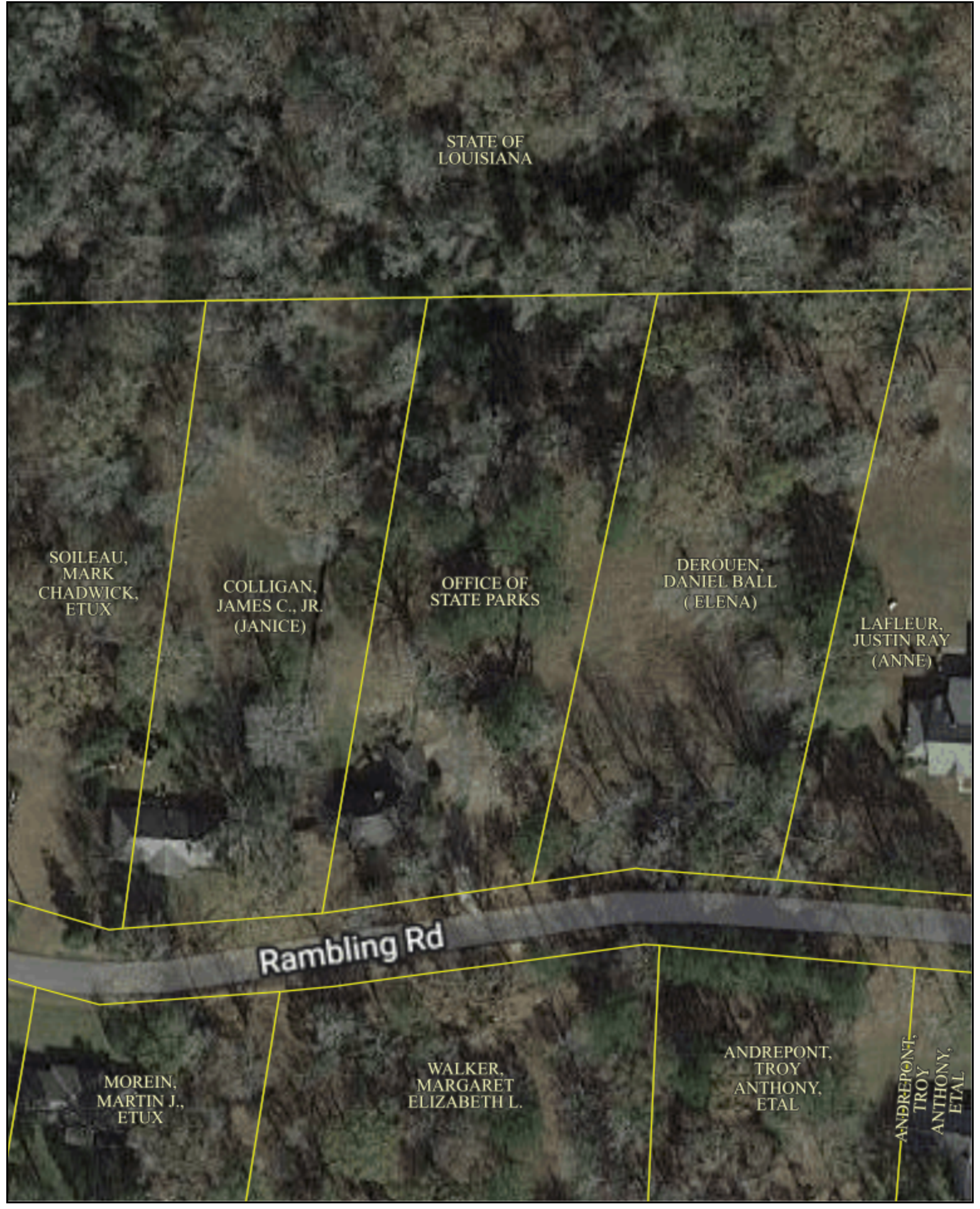
1 inch = 80 feet