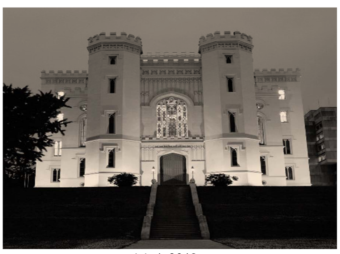
July 1, 2018